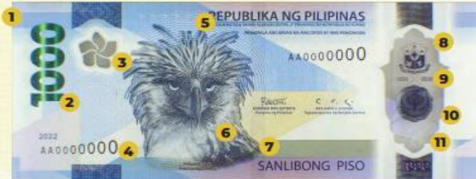
Obverse Design Highlights: Philippine Eagle ( Pithecophaga jefferyi ) and Sampaguita ( Jasminum sambac )