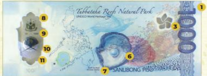
Reverse Design Highlights: Tubbataha Reefs Natural Park (UNESCO World Heritage Site), South Sea Pearl ( Pinctada maxima ), and Tnalak weave design